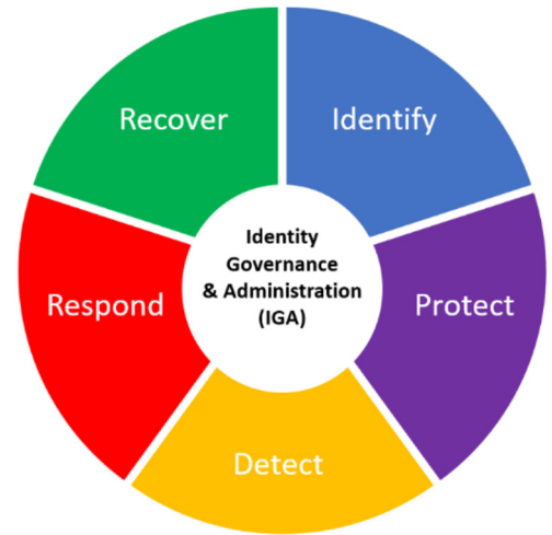
NIST Cybersecurity Framework

Recover – provides business process automation and workflows to ensure that all access is authorized, appropriate, and suitable and removed when no longer valid or required.