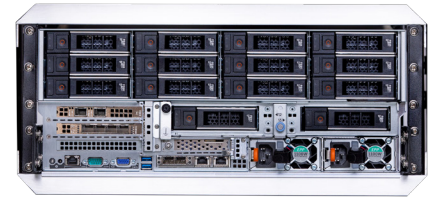
The Tracewell T-4400

Dell EMC PowerProtect DP4400 Appliance delivers 8TB-96TB of backup and recovery capability and protects up to 5PB of usable logical capacity.