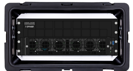
The Tactical T-4400