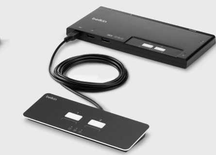
2-Port, Dual-Head Modular Secure KVM Switch w/Remote F1DN202MOD-BA-4