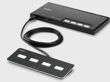
4-Port, Single-Head Modular Secure KVM Switch w/Remote F1DN104MOD-BA-4