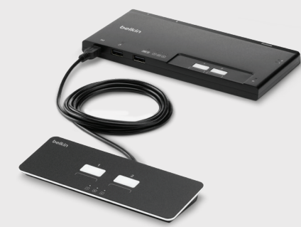
2-Port, Single-Head Modular Secure KVM Switch w/Remote F1DN102MOD-BA-4