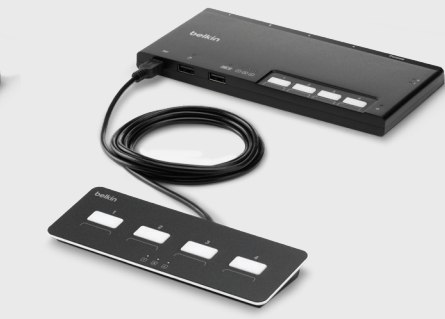
4-Port, Dual-Head Modular Secure KVM Switch w/Remote F1DN204MOD-BA-4